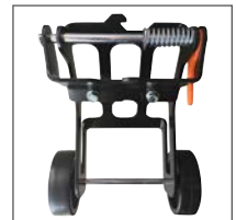
OPTIONAL UHMW PAVING PAD FOR INTERLOCKING PAVING BLOCKS