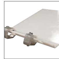
OPTIONAL UHMW PAD