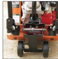
OPTIONAL WHEEL KIT