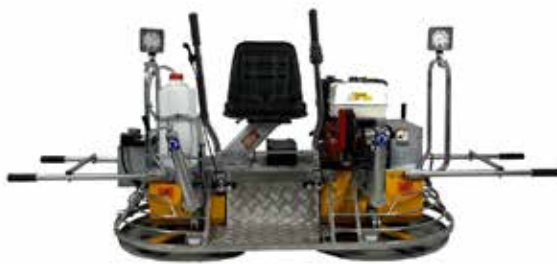
Set of detachable lifting handles supplied with each machine