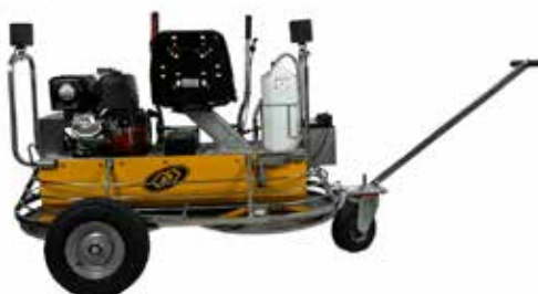
*Optional Transport Trolley Available