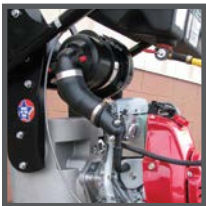
AIR FILTER OPTION