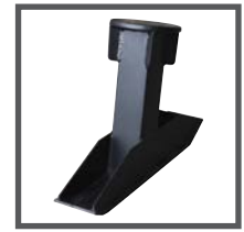
4" & 6" NARROW SHOE WITH 12" EXTENSION