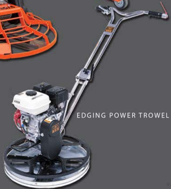
EDGING POWER TROWEL