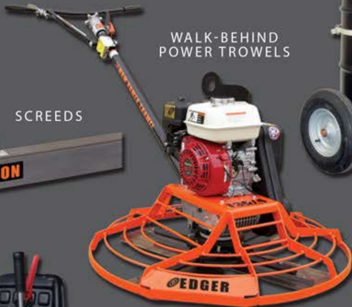
WALK-BEHIND POWER TROWELS